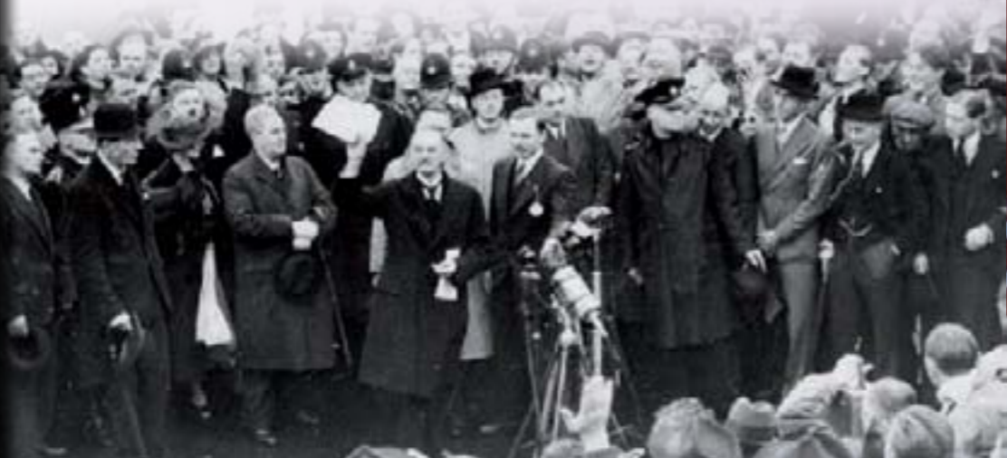
Neville Chamberlain